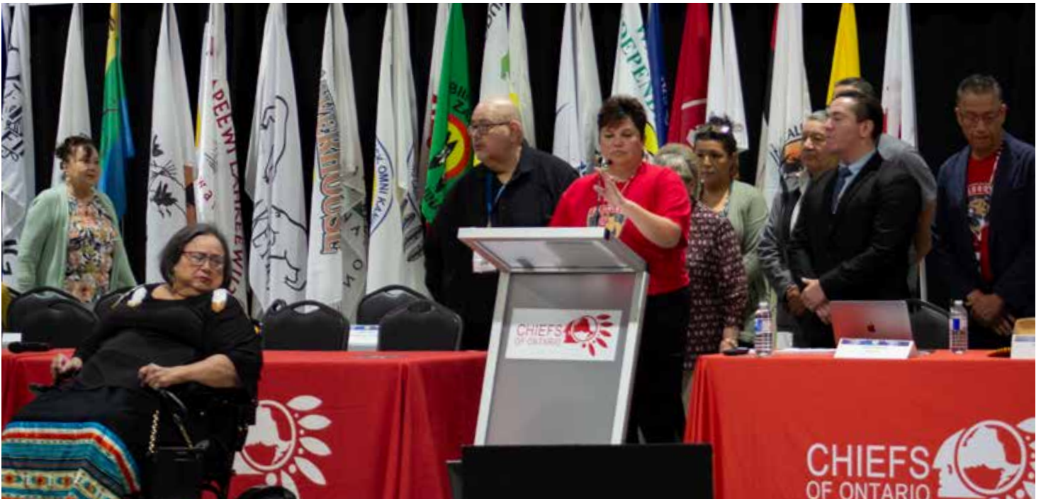
On June 13, Elected Chief & Council address staff and dignitaries at the Chiefs of Ontario Annual Chiefs Assembly.